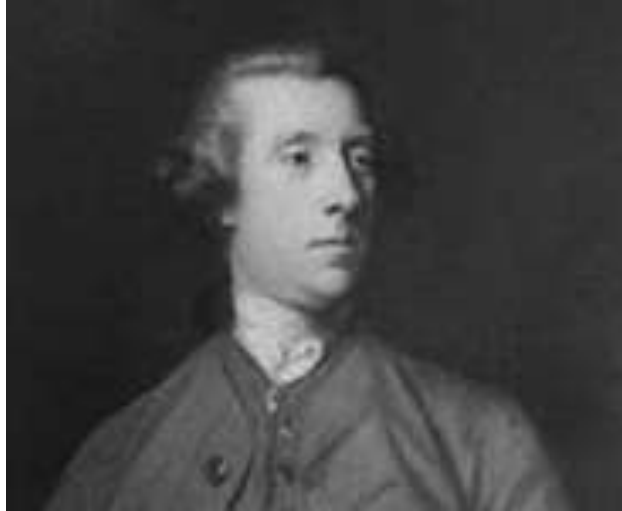
Detail of Portrait of Lord Lieutenant of Ireland, Simon, 1 st Earl Harcourt, 1754, by Sir Joshua Reynolds