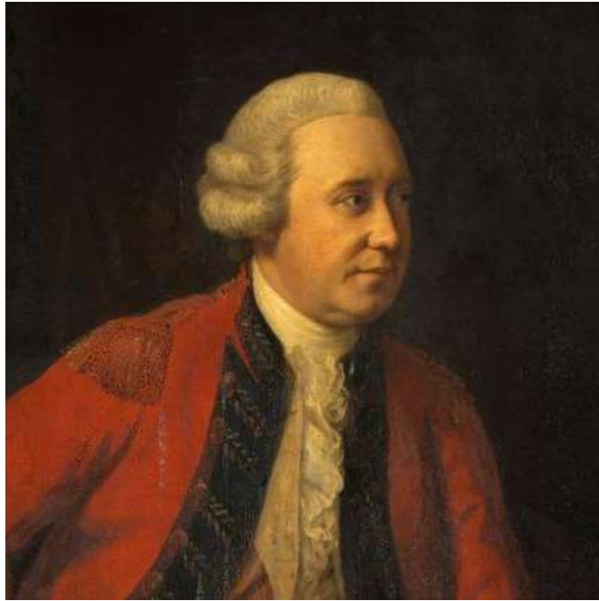
Detail of Portrait of Lt. Gen. Sir James Adolphus Oughton, 1778, by John Downman

Source and Note: TNA, Secretary-at-War, Out-letters , WO 4/96, p. 223 (f. 112). Unfortunately no record of this this review can be located in the War Office files.