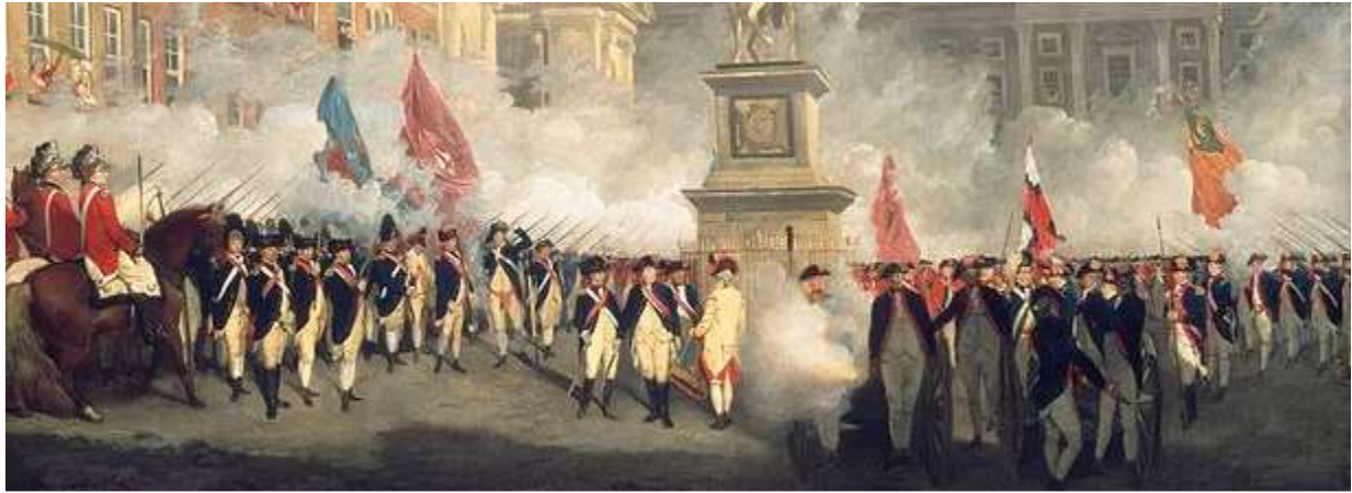
Detail from "The Dublin Volunteers on College Green, 4 th November 1779," by Francis Wheatley