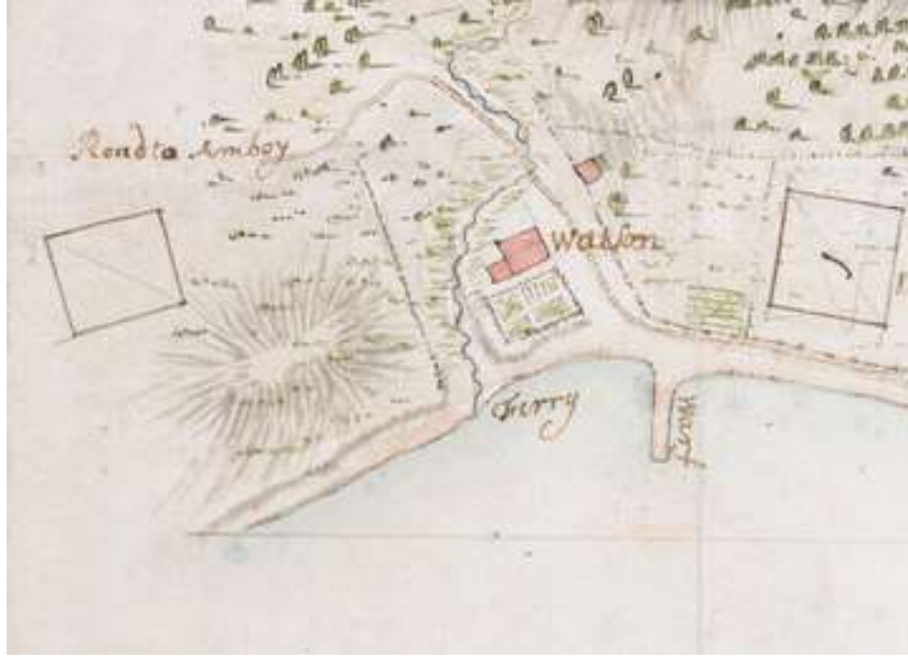
Detail showing Watson's Ferry from "A Sketch of Part of Staten Island," 1755

North is to the right.