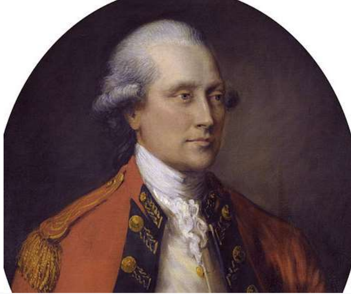
Detail from "Portrait of John Campbell, 5 th Duke of Argyll," by Thomas Gainsborough

Picture Source: Wikimedia Commons, from Sotheby's