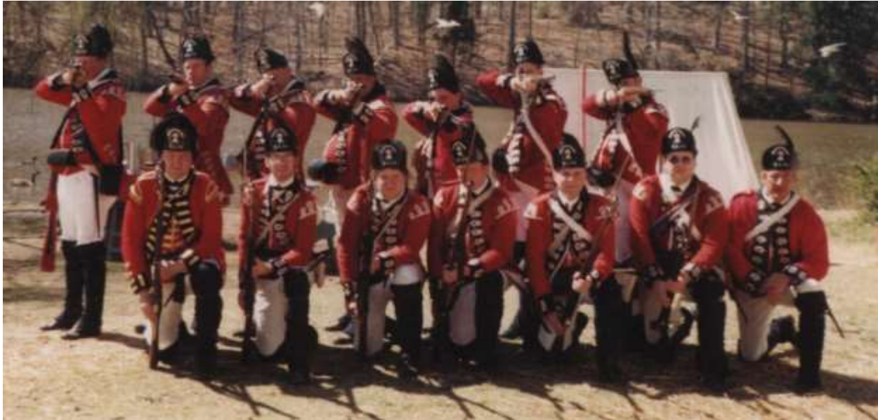
Recreated 42 nd Lt. Infantry Company

by Paul Pace, June 2019 © all right reserved