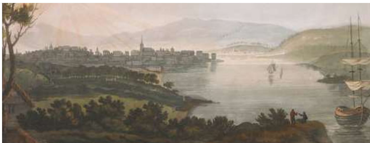
Detail from "East View of the City of Waterford," 1795, by Samuel Alken

Source: TNA, War Office, Inspection returns, Irish, 1774 at WO 27/32, May 14 1774. The combined review of the six regiments is filed with the review of the first regiment listed; the 22 nd Regt.