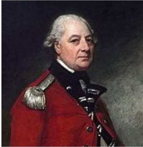
Detail of Portrait of George, Viscount Townshend, Lord Lt. of Ireland, 1792, by George Romney