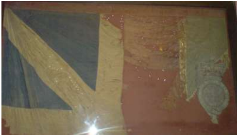
Remnants of Original 2 nd Battalion, 42 nd Regt. King's Color, Dunvegan Castle, Scotland