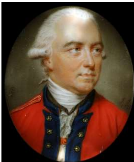
Lt. Gen. Henry Clinton, 1777, by John Smart