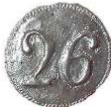
Reproduction 26 th Regt. Uniform Button

Source: Source: "Orders, 1778-1782," Sir Henry Clinton Papers, Vol. 266, William L. Clements Library, Univ. of Michigan. The 42 nd Regt. was not present New York because they were stationed 44 miles north of the city at Stony Point from July 19- Oct. 20, 1779