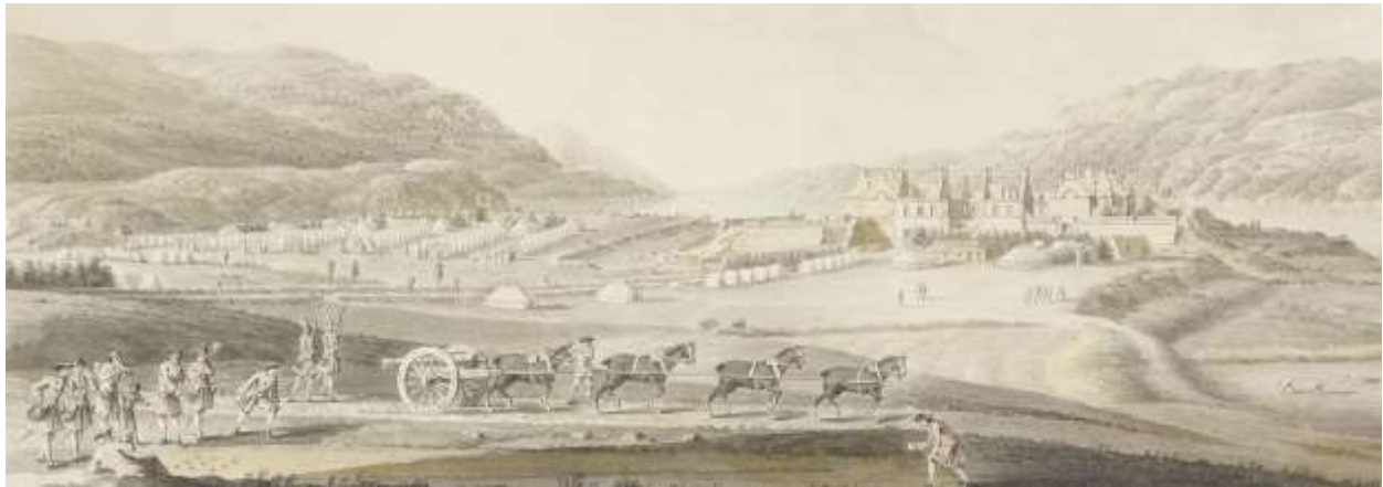
Detail from Picture of Fort Augustus, 1746, by Thomas Sandby