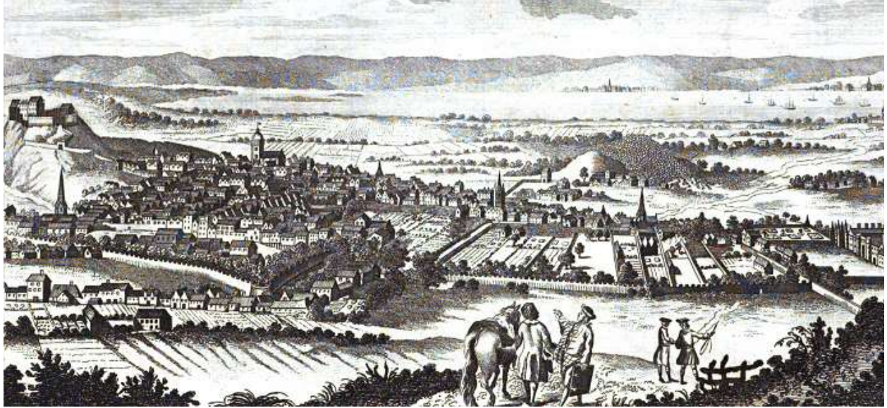
Detail from "A General View of the City & Castle of Edinburgh, the Capital of Scotland," 1784