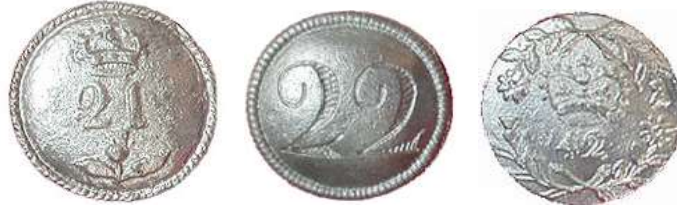
Reproduction 21 st , 22 nd and 42 nd Regt. Uniform Buttons

Source: "Orders, 1778-1782," Sir Henry Clinton Papers, Vol. 266, William L. Clements Library, Univ. of Michigan.