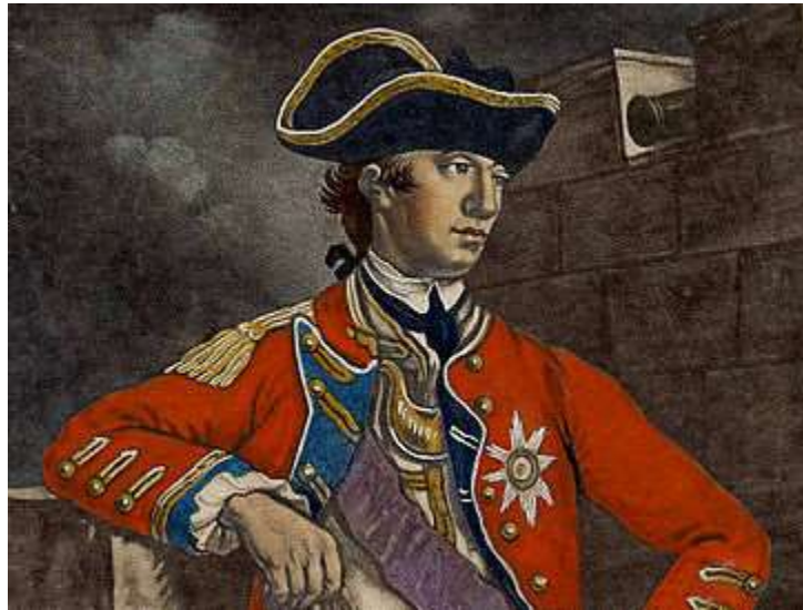
Detail of "The Hon ble . S r . W m . Howe," 1777