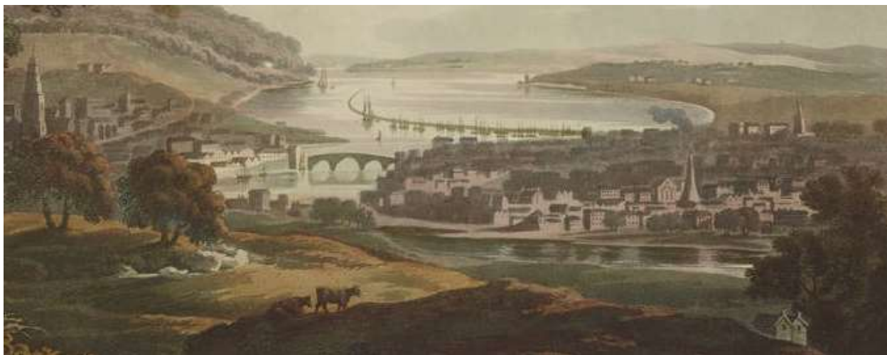
Detail from "City of Cork," 1799, by Samuel Alkin