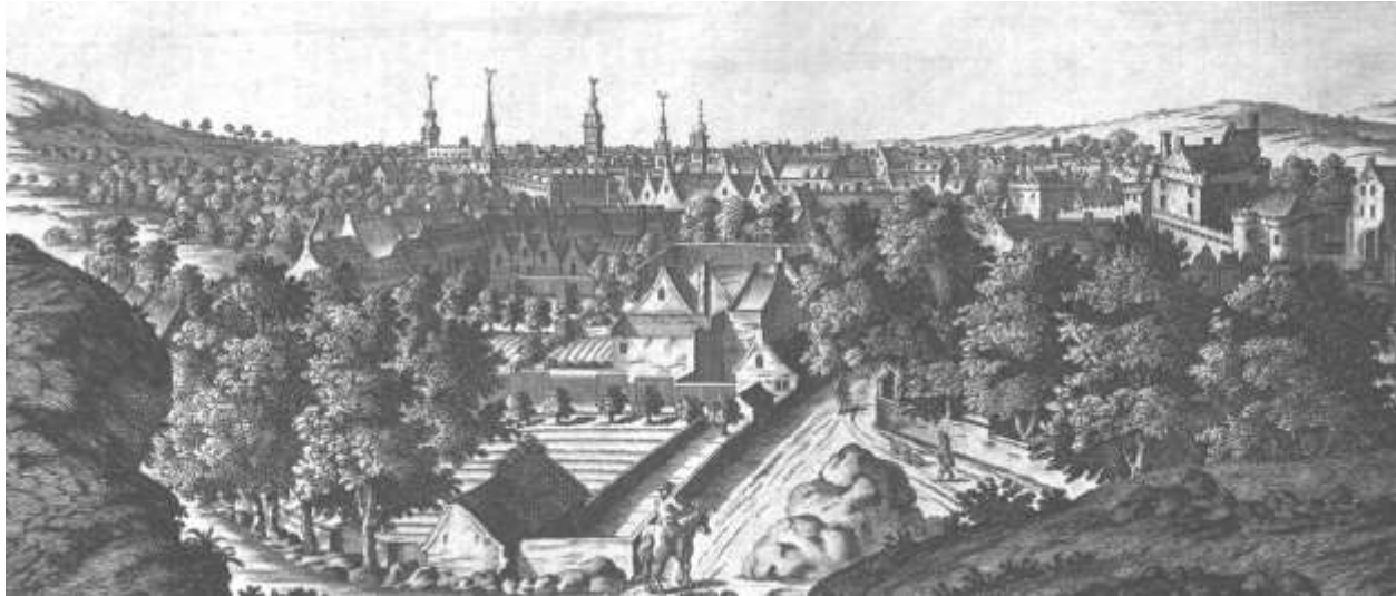
Detail from "View of the City of Glasgow, in the County of Clydesale," 1784