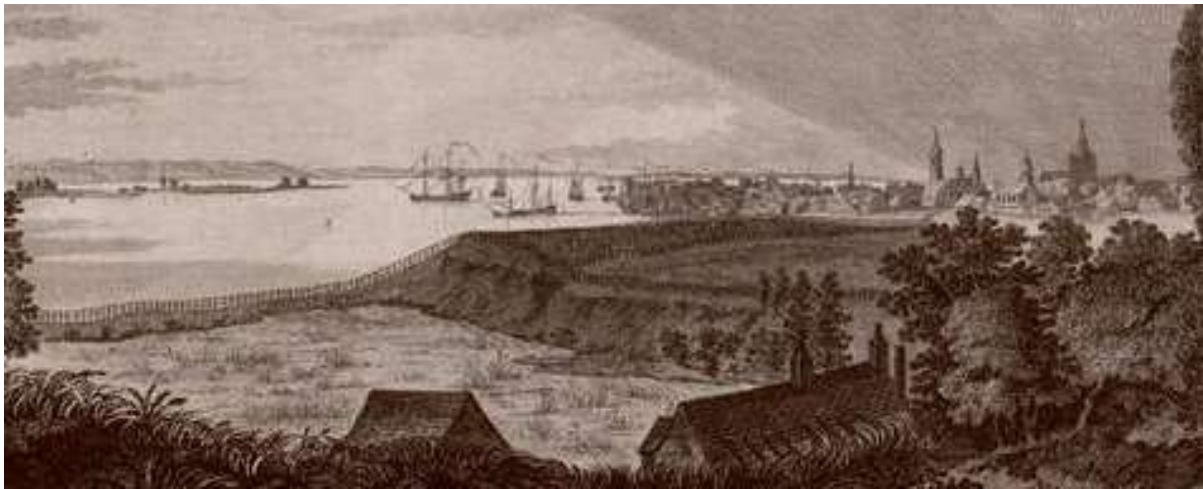
Detail from "A South West View of the City of New York, In North America," 1768, by Capt. Thomas Howdell, Royal Artillery

Source: NRS, "13 notebooks containing the journal of Lt. [latterly Capt.] John Peebles of the 42 nd or Royal Highland Regiment, during the American War of Independence," Papers of the Cuninghame Family of Thorntoun, 1776-1782 at GD 21/492/2,