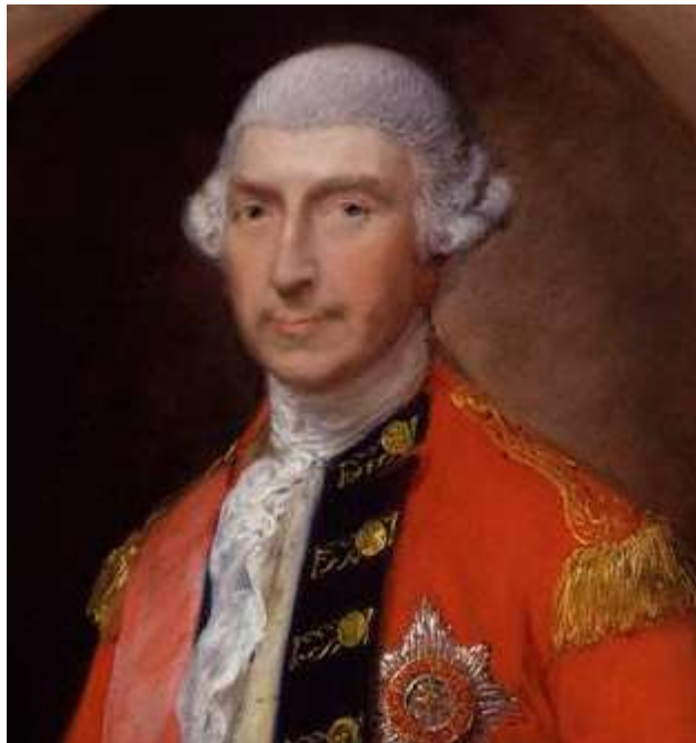
Detail from Portrait of Jeffery Amherst, 1st Baron Amherst, 1785 , by Thomas Gainsborough

Source: TNA, Baron Jeffrey Amherst, Commander in Chief, Papers, Misc. Letters from Lord Amherst, May 26, -Nov. 1, 1781 at WO 34/237, p. 361.