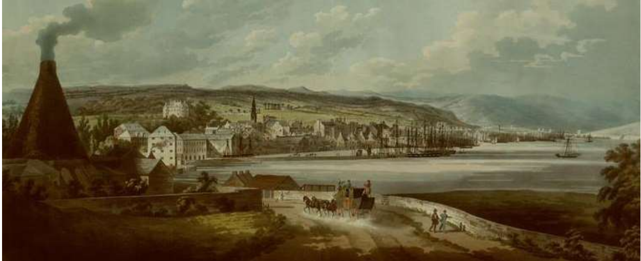
Detail from "Greenock," 1812, by Francis James Sarjent