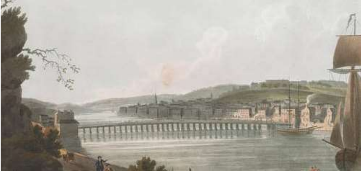
Detail from "West View of the City of Waterford," 1795, by John W. Edy