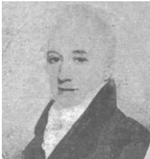
Maj. William Nairne

Sources: TNA, War Office Out-Letters, General Letters, June – Oct. 1781 at WO 4/115, pp. 210-211 (f. 106), War Office In-Letters: 3. General Correspondence: b. Series II: M-P, 1781 at WO 1/1012, p. 67 and War Office Out-Letters, General Letters, June – Oct. 1781 at WO 4/115, p. 274 (f. 138).