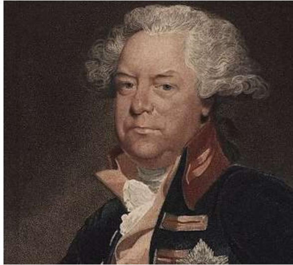
Detail from Engraving "The Right Honorable Sr George Yonge B t / Secretary at War, Knight of the Bath," 1790, after Mather Brown