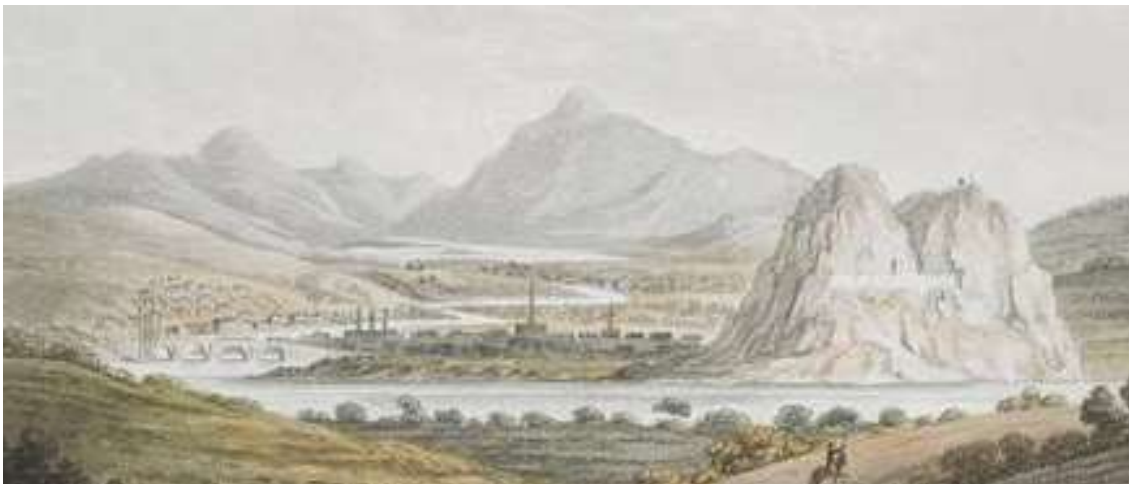
Detail showing Dumbarton from "Confluence of the Rivers Clyde & Leven," 1797, by Francis Jukes

Source: TNA, War Office: Secretary-at-War, Out-Letters, General Letters, Feb. 1778 – May 1778 at WO 4/102, p. 179 (f. 90) and Colonial Office Papers , CO 5/170, p.77 with copy at CO 5/256, pp. 212-214.