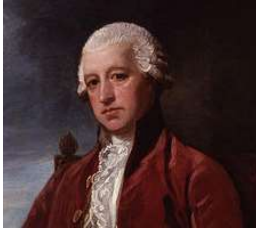
Detail from Portrait of Secretary at War Charles Jenkinson, before 1802, by George Romney