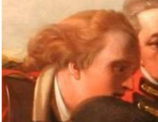
Lt. Col. Simon Fraser, 78 th Highland Regt. from "The Death of Wolfe," 1770, by Benjamin West