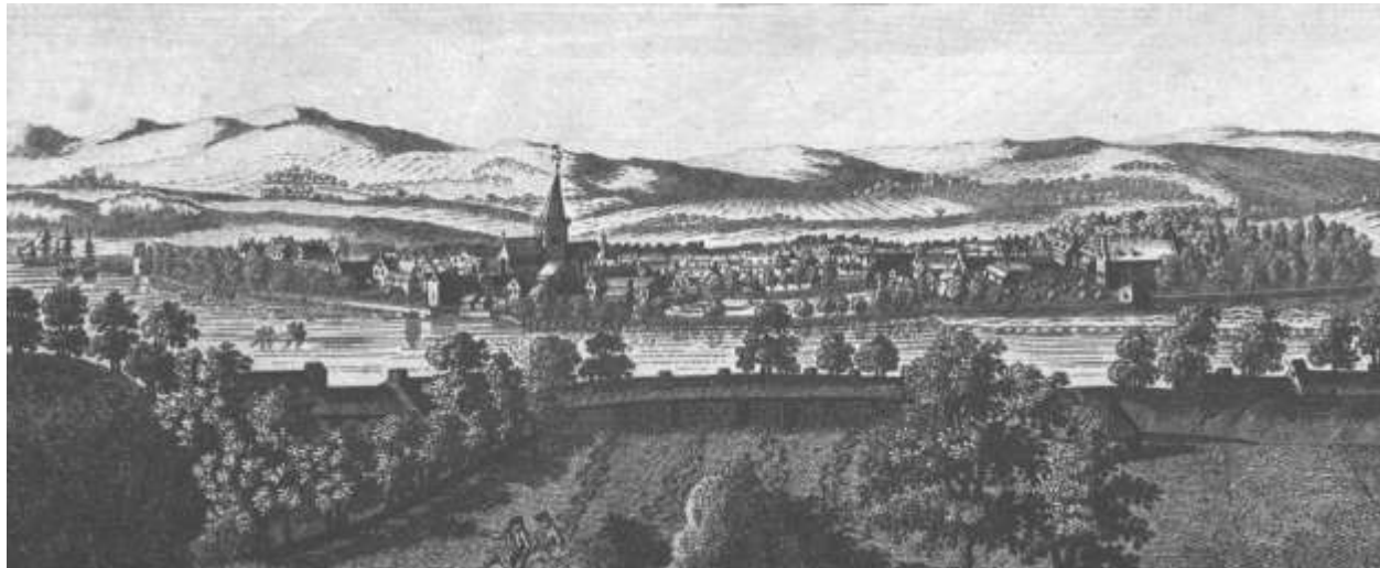
Detail from “View of Perth, the Capital of Perthshire,” 1784,