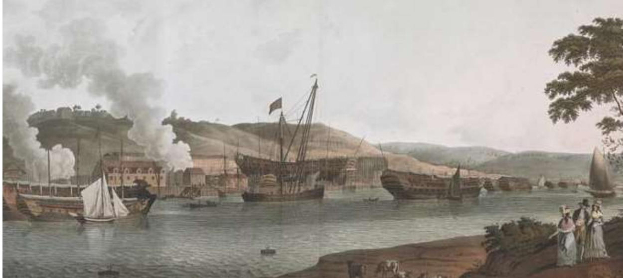
Detail from "The Royal Dockyard at Chatham," 1789, by Robert Dodd