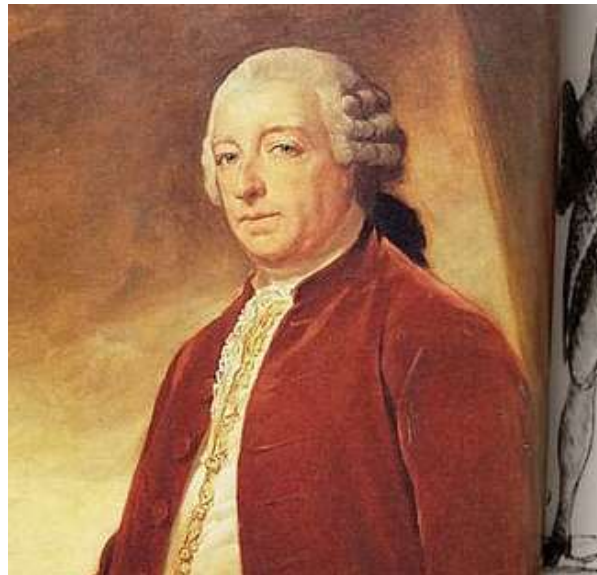
Detail from Portrait of Lord George Germaine, 1766, by George Romney