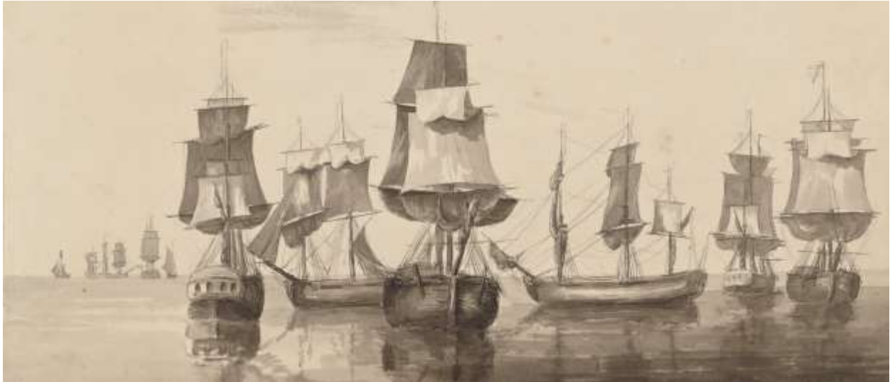
Detail showing transports from "26 th June 1776," by Archibald Robertson