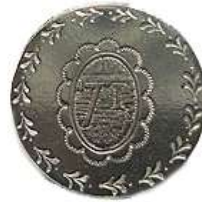
Reproduction 71 st (Fraser's) Highland Regt. Officer's Uniform Button