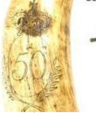
Detail from Powder Horn of 50 th Regt., Napoleonic Period