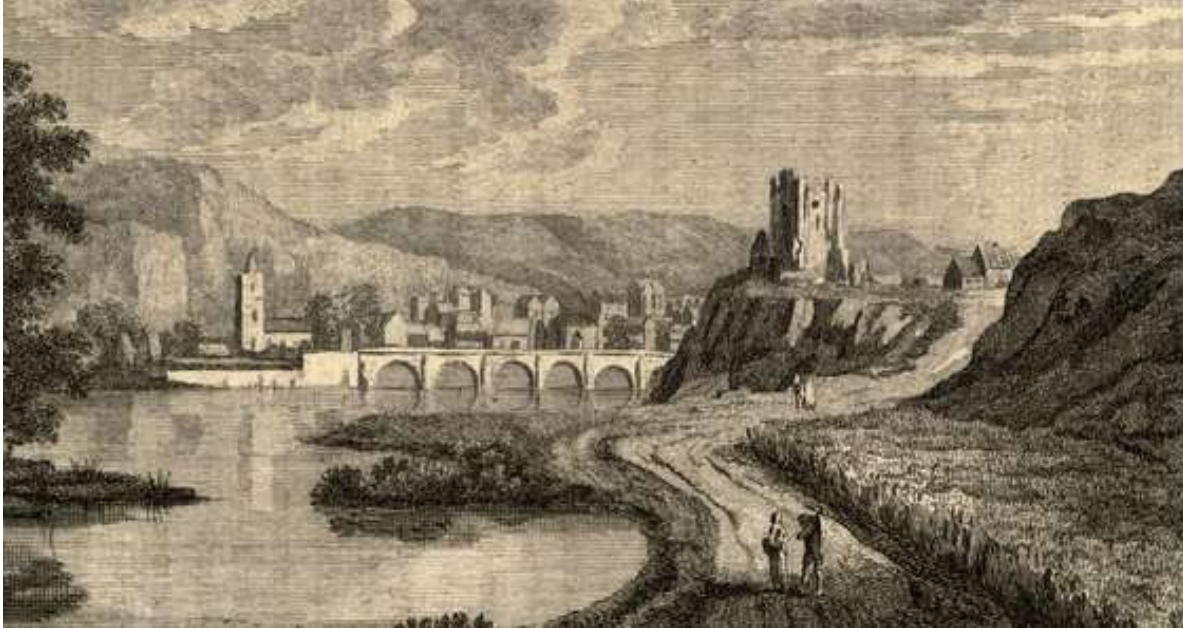
Detail from "Inverness," 1771

Picture Source: Wikimedia Commons, from A Tour in Scotland MDCCLXIX [1769], John Monk, 1771