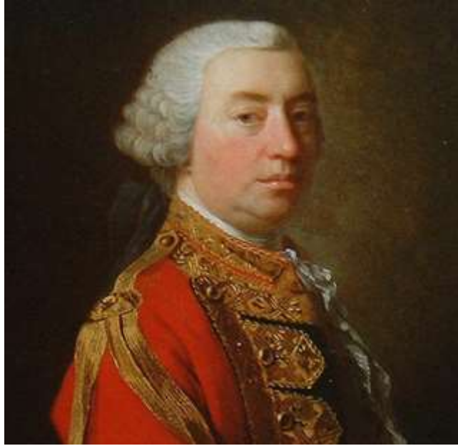
Detail from Portrait of Lord John Murray, 1759, by Allan Ramsay