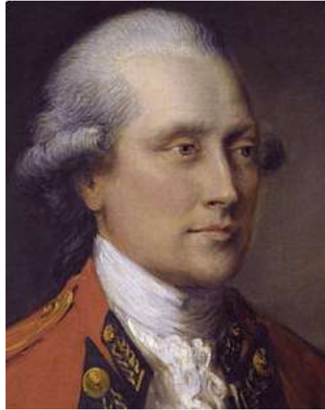
Detail of Portrait of John Campbell, 5 th Duke of Argyll, by Thomas Gainsborough