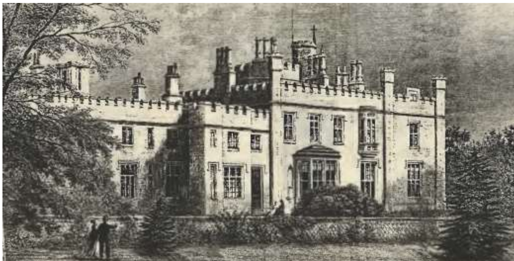
Banner Cross, Sheffield

Source: TNA, Treasury Papers, England and Wales: Correspondence from the Secretary at War, Lord Barrington: Estimated cost of augmentations to the 42nd Regiment of Foot from 25 Aug. at T 1/518./45-48. A copy of the letter is also at War Office Out-Letters, General Letters, July 1775-Nov. 1775 at WO 4/94, p. 500 (f. 253).