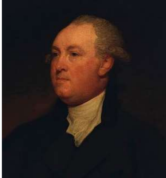
Detail of Thomas Townshend, " Lord Viscount Sydney ," 1785, by Gilbert Stuart

Picture Source: Wikimedia Commons, from State Library of New South Wales