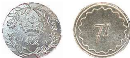
Reproduction 42 nd and 71 st Highland Regt. Uniform Buttons