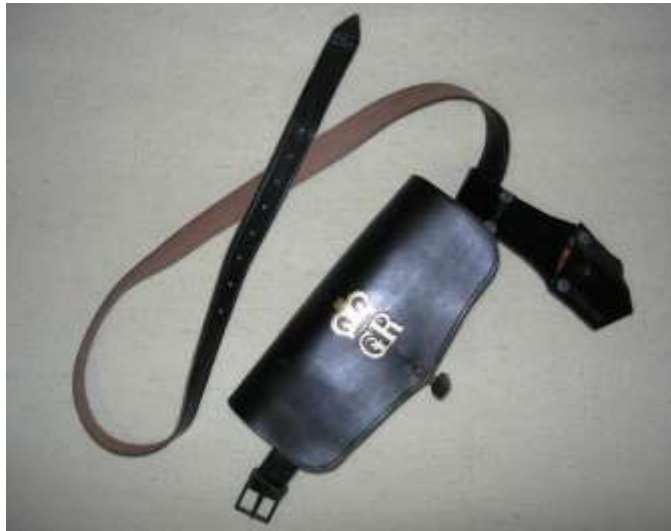
Reproduction Cartridge Box and Straps