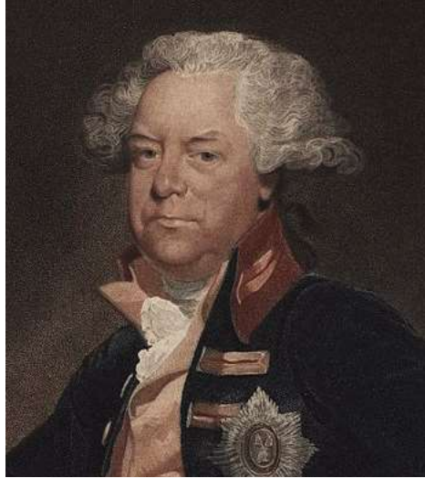
Detail of "The Right Honorable Sr George Yonge Bt / Secretary at War, Knight of the Bath," 1790, by Mather Brown