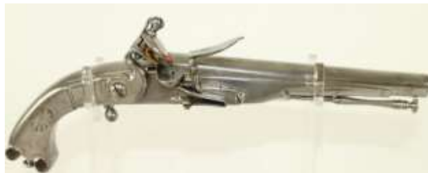
Photo of Original, Regimentally Marked, Isaac Bissell Steel Hilted Pistol