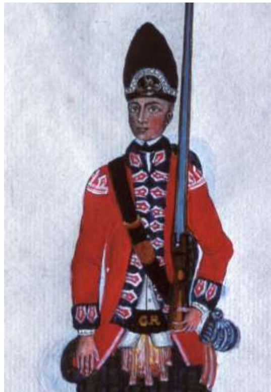
Detail of 42 nd Regt. Grenadier, Grenadier Book, Aldershot Depot