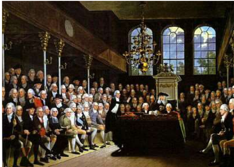
“William Pitt addressing the House of Commons on the outbreak of war with Austria,” 1793, by Karl Anton Hickel

Source: TNA, Records of the Paymaster General's Office, Army Establishment Miscellaneous Books at PMG 14/69, p. 46.