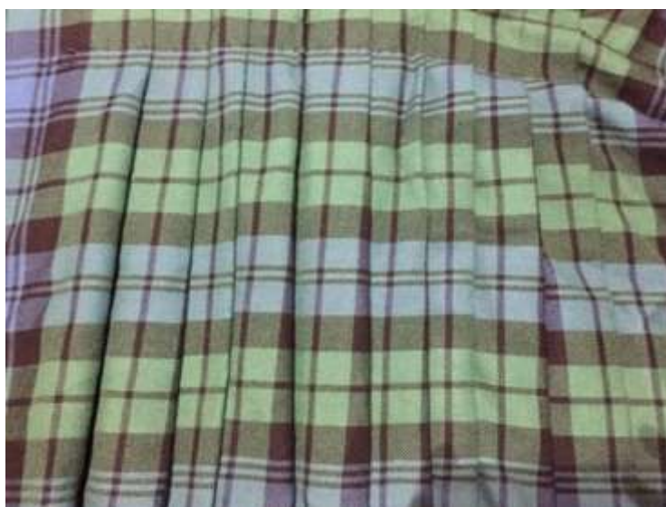
Reproduction Belted Plaid in “42 d ” Pattern

Source: Cover sheet title: “ M r Hetherington 18 th March 1779 inclosing an Acc t of the Cloathing for 1778 ” in the Lord John Murray Papers , B 5/2/38.