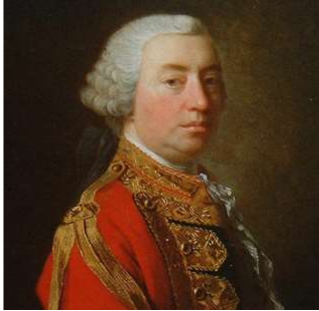
Detail from Portrait of Lord John Murray, 1759, by Allan Ramsay