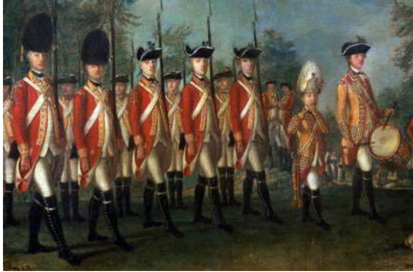
Detail from "Lord George Lennox, Colonel of the 25 th Regiment of Foot," c. 1771, by Giuseppe Chiesa