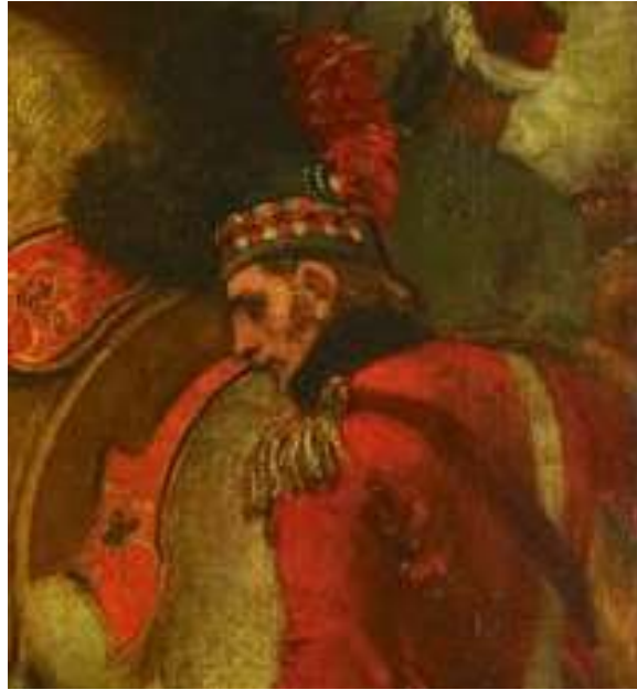
Detail showing Maj. James Stirling, 42 nd Regt. from “ The Death of General Sir Ralph Abercromby, K.B. , 1802, by Thomas Stodhard