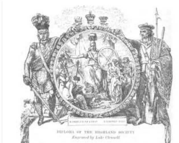
Diploma of the Highland Society of London, 1805